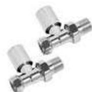
Cylindrical-30 Straight Manual Rad. Valve + L/S set CYH851C

See page 62 for more valves and accessories