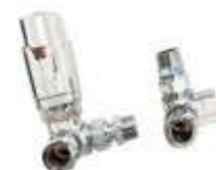
Corner Thermostatic Valve & TRV Head UAW853CT